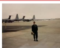
SITREP EDITOR RIA MATTIX